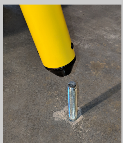
Step 4. Move Bolt Breaker back and' forth, then in a circular motion until bolt breaks free.