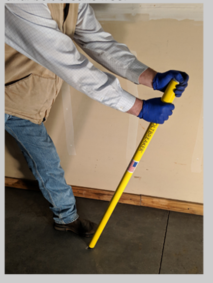
Step 4. Move Bolt Breaker back and' forth, then in a circular motion until bolt breaks free.